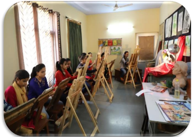
Fine Arts Lab