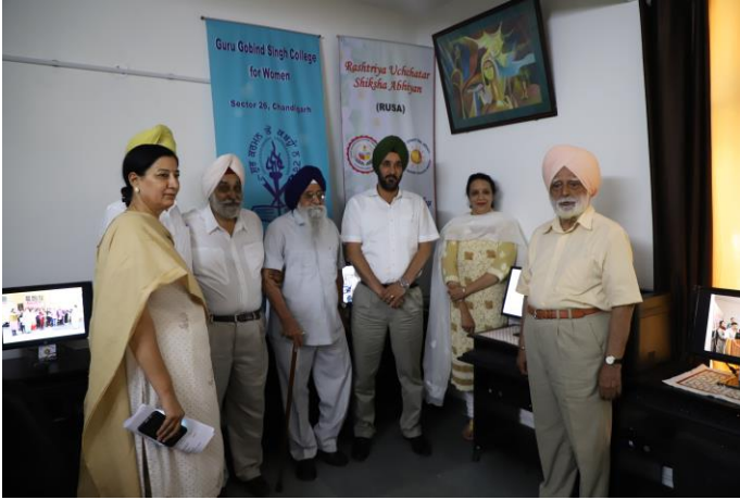
Inauguration of Research Lab